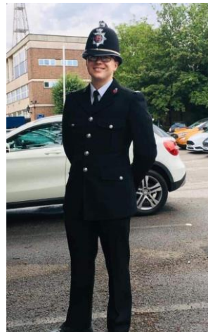
Harrison 2018-19 Essex Police