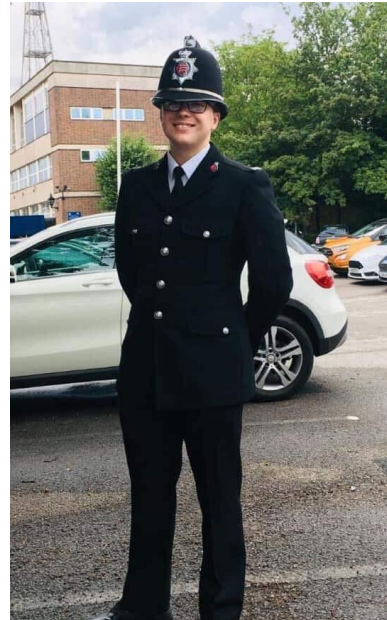
Harrison 2018-19 Essex Police