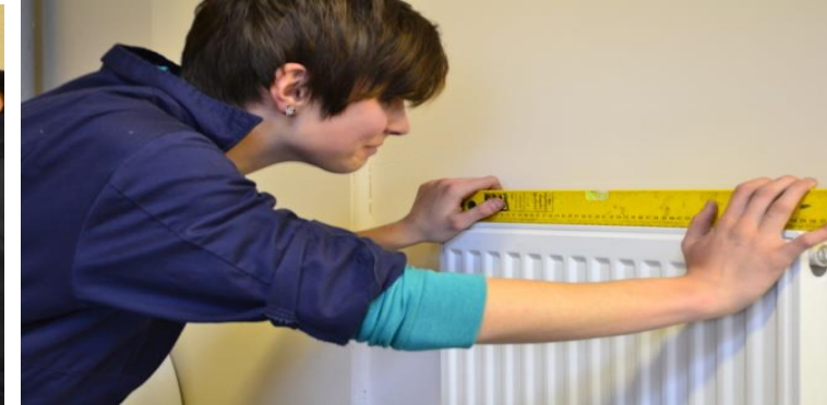
Learning measuring, levelling and accuracy