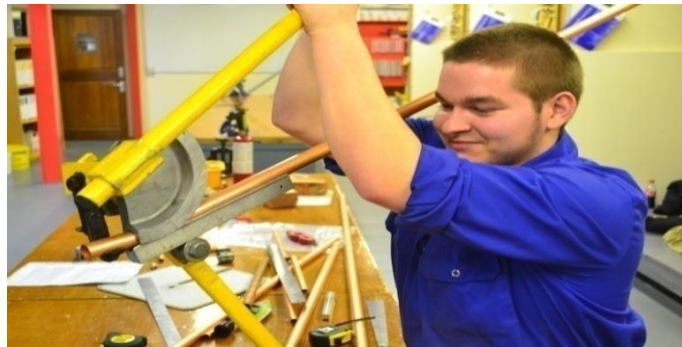
Bending Copper Accurately