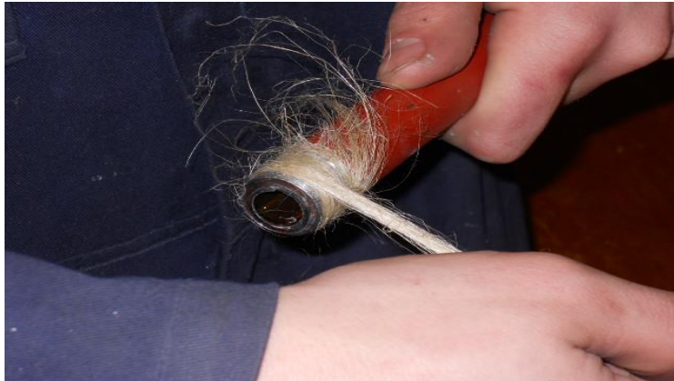
Hemp & Paste on LCS

Here are some examples of the work that we do: