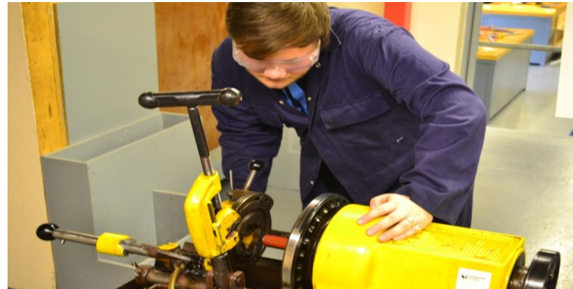
LCS Threading & Cutting